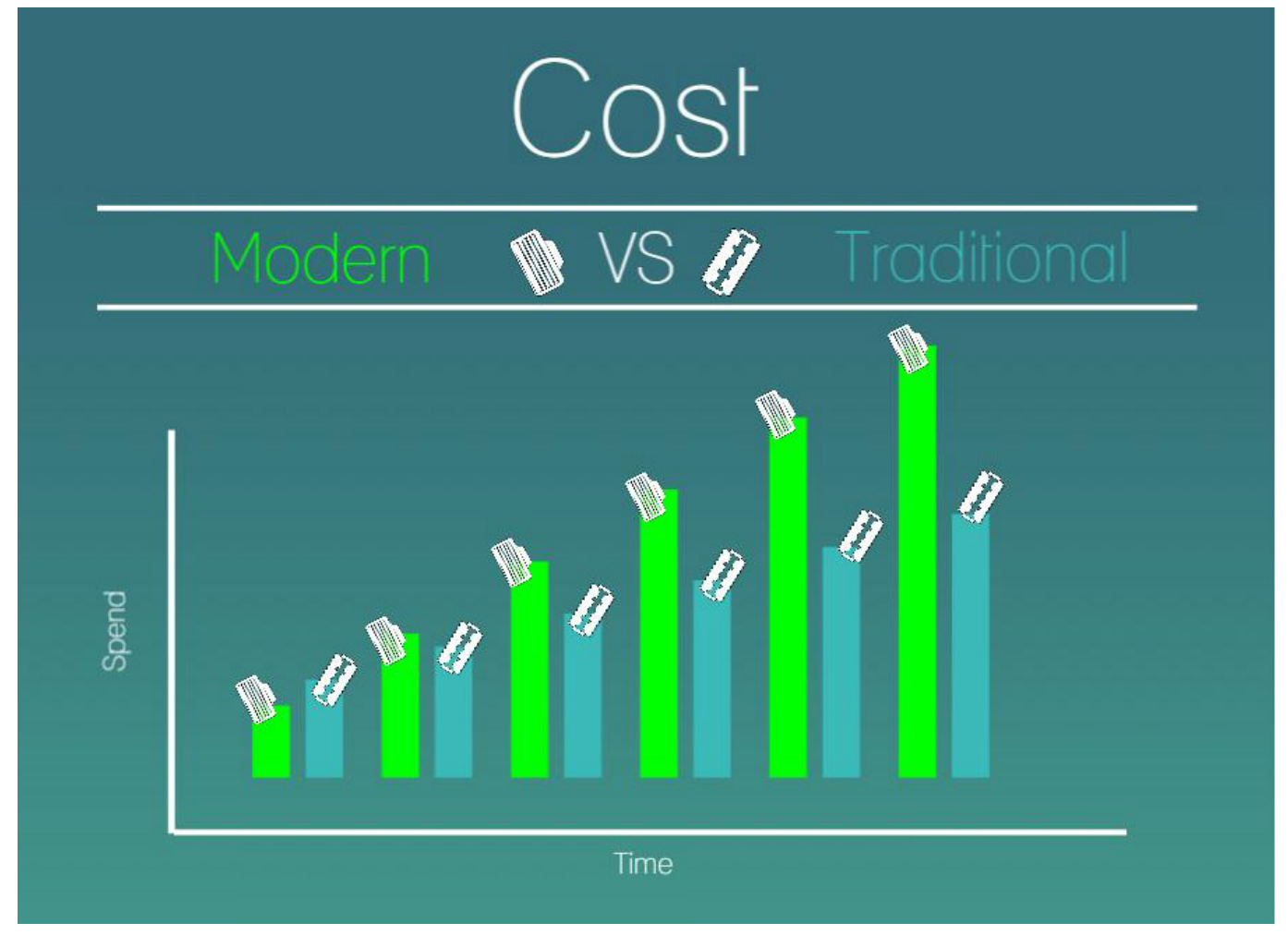
Here's How to Play Android Games In Play Store Without Downloading...